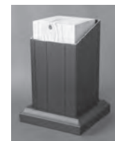
4-Piece Post Wrap 6"x6"x10'