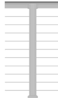
Cable Rail with Drink Rail