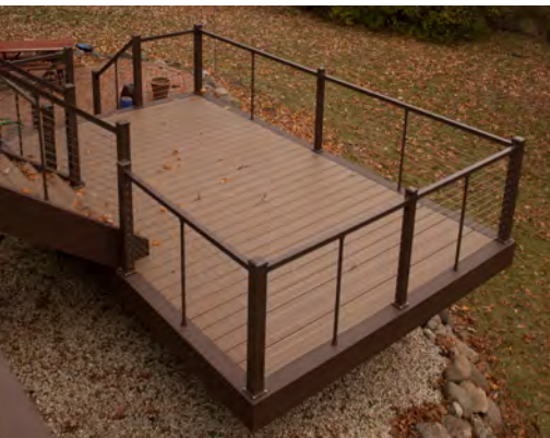
DURABLE AND RELIABLE